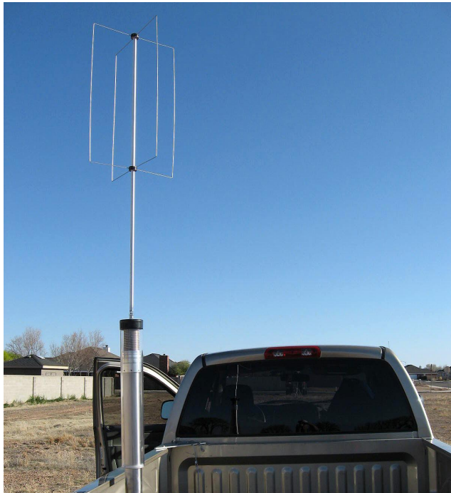
This is the Scorpion SA-680 Standard Antenna mounted at the rear corner in my Dodge RAM 1500 pickup. Also installed is the Scorpion Top Hat on a 4 foot mast.